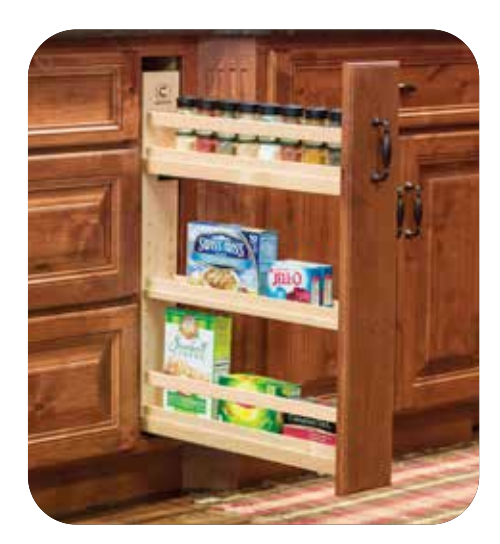
Pullout Spice Rack